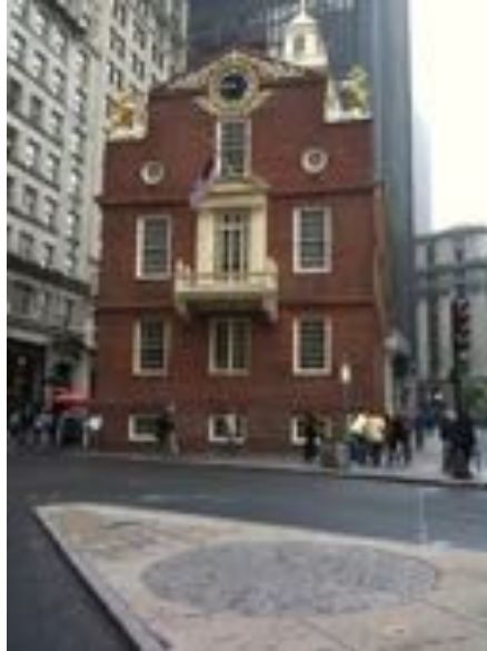
Sight of the Boston Massacre Kings Street